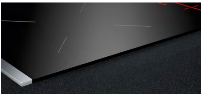
USL515 BORA side frames for cooktop depth 515 mm