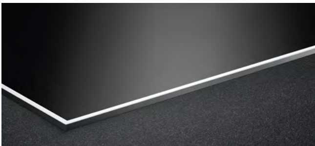
BKR760 BORA cooktop frame for width 760 mm